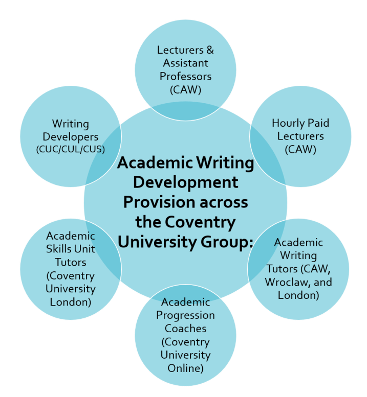
Figure 2. Academic Writing Development Provision across the Coventry University Group